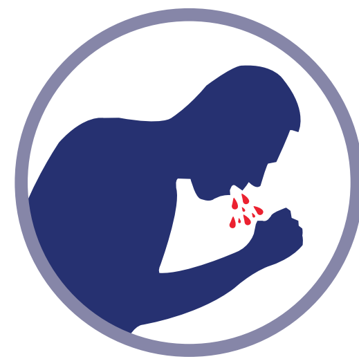
Coughing up blood or pink, foamy mucus