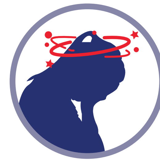
Feeling faint or passing out

HAVE THE TALK NOW: IF CAUGHT EARLY BLOOD CLOTS CAN BE TREATED