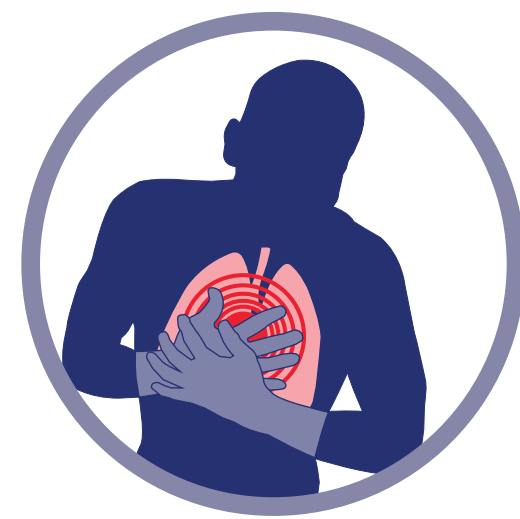
Chest pain with breathing