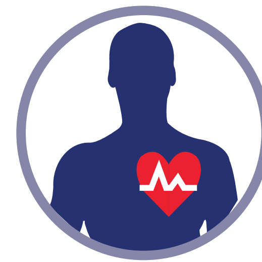
Elevated heart rate